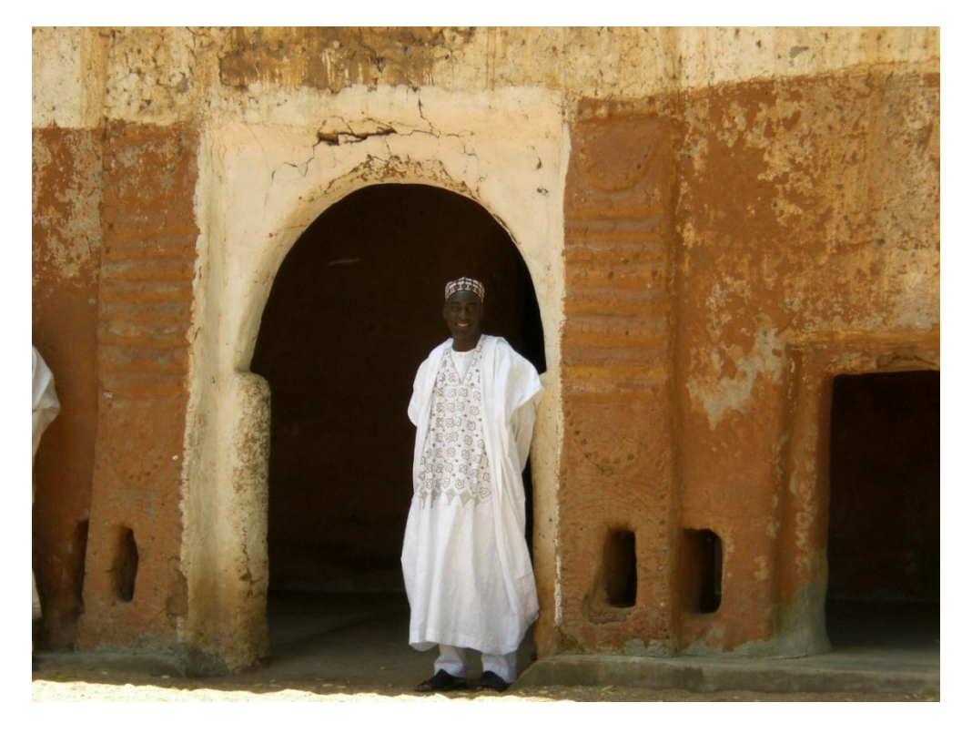
Policies against Hunger 2013

North Cameroon: short term (vertical) decision by a traditional authority (lamido)