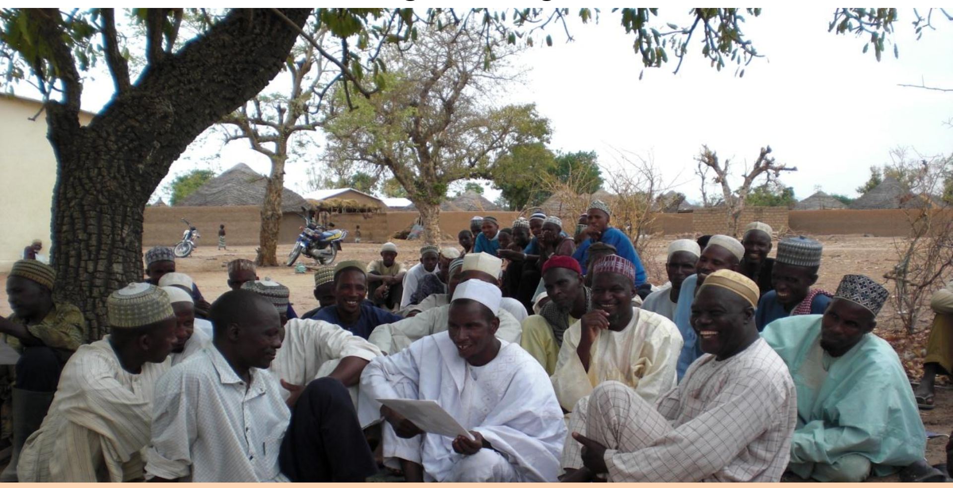
Village committees in North Cameroon:

Composed of farmers and (sedentary) cattle keepers Elaboration of common vision of the village land, agreement on rules and regulations Support to the horizontal processes by trained NGOs, international cooperation or church partners (Mali, Burkina Faso and Cameroon)