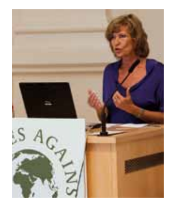
Dagmar Wöhrl, Member of the German Bundestag, Chairwoman of the Committee on Economic Cooperation and Development

It is important to achieve food sovereignty and to support agricultural production and regions more than in the past. The issue of land grabbing needs to be addressed. Investment is important, but there is also a need to recognize the practice of land grabbing. There is a need to take up this issue at international level. State and non-state purchases of land at international level must be regulated by international rules. It needs reliable and secure legal frameworks, socially responsible land distribution and more transparency to guarantee protection of investors and above all of domestic populations. We can contribute a lot with extension services and with aid to build up new cooperative structures. A subsistence-smallholding farmer will not be able to face big agricultural industry but many small-scale farmers, if they form partnerships in cooperatives, have the potential to be economically more successful in the future. We all share one goal: we are all living on one unique planet and we need to ensure that future generations have decent lives on this planet too.