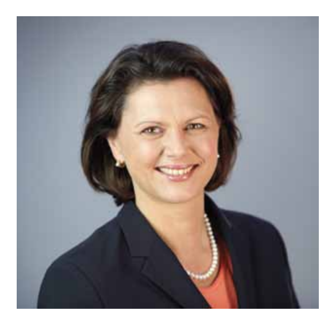
Dear reader, Dear conference participants,

The eighth Policies against Hunger conference discussed the subject of "Improving Governance for Food Security and Nutrition" and formulated specific recommendations for action.