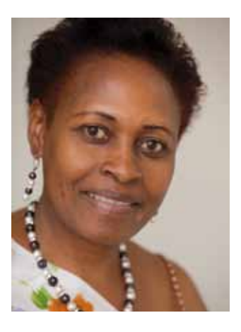
Hope Mwesigye, Minister of Agriculture, Uganda

the past must definitely not be repeated. If the CFS had worked properly, maybe the Washington Consensus would not have had this vast effect of disinvestment in agriculture or we would not have dumped food on local markets, throwing out local small-scale farmers in developing countries. There is an urgent need to tackle land issues, in particular to stop land grabbing. Land grabbing is continuously producing hunger and malnutrition. Smallholder-producers are the main group suffering from hunger in the world, despite most of the production of food coming from smallholders. The peasants' and social movements that have defended food sovereignty for more than ten years, therefore, have to be heard. We are not talking of food only as a commodity; we are talking of food as a common good. The right-based approach is an important tool, in order to put people at the center of policies. The Global Strategic Framework for Food Security and Nutrition should be strongly based in principles of human rights and the UN Charter that all governments are committed to fulfil.